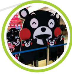
Advertising Printing Industry