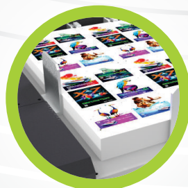
Automatic Lifting Material Device