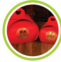
Wedding Gift Industry