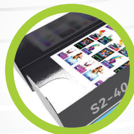
Finished Product Collection